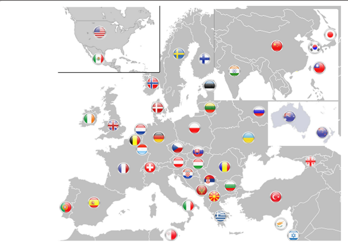
Figure 1 International EPMA platform: worldwide 45 countries actively contribute to the creation and implementation of innovative PPPM concepts in medical sciences, technologies and healthcare. The group of the National Representatives (National EPMA BOARDs) is the key element in the structure of the association which consolidates and coordinates the EPMA-related activities at the national level closely working with all PPPM-related national institutions, units and groups such as Federations of Patients, Universities, research units, state and private hospitals, insurance, industrial groups, policy-makers, etc. More information—please see the EPMA website www.epmanet.eu.